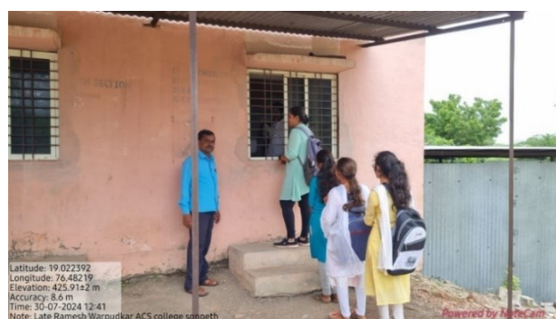
Administrative Window for Girls