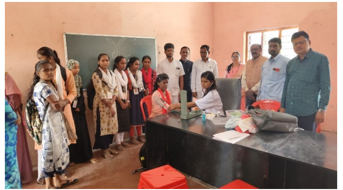
Helth Checkup Camp for Girls