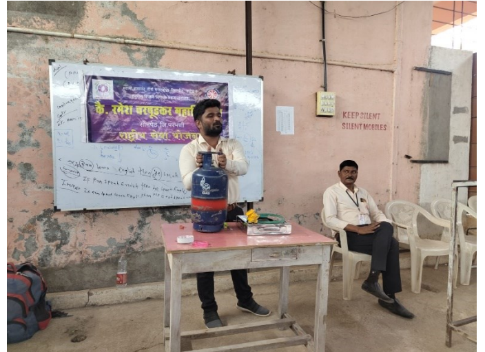
Womens safety workshop, safety during cooking on gas at home