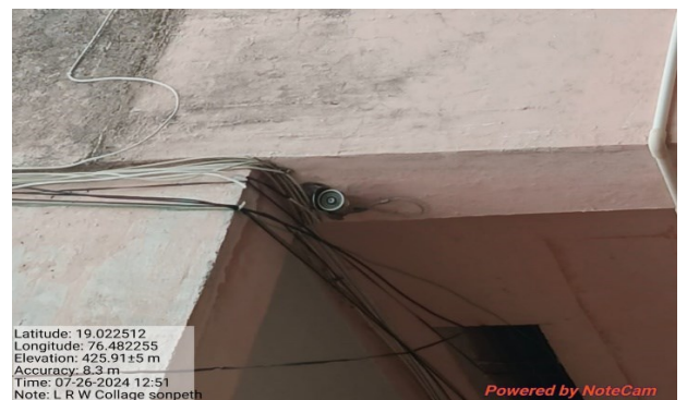
CCTV surveillance at common places