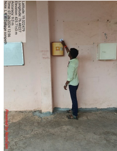
Complain box Ladies