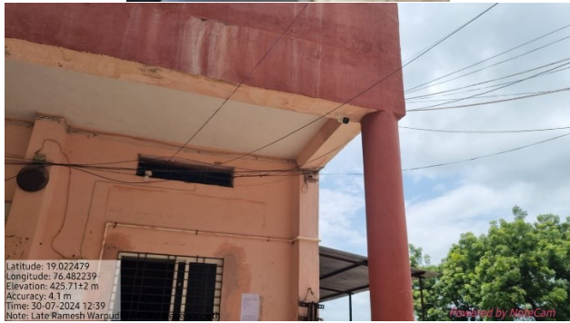
CCTV surveillance at common places