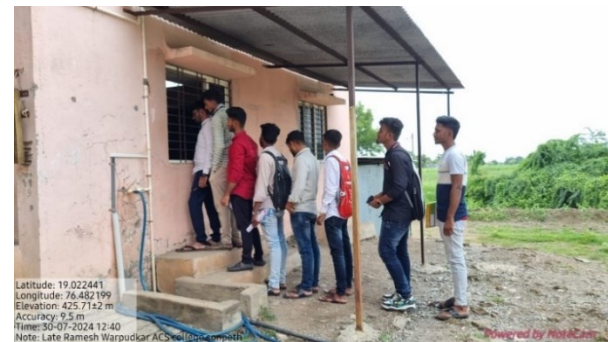
Administrative Window for Boys