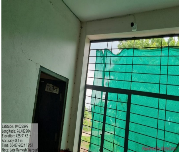
CCTV surveillance at common places