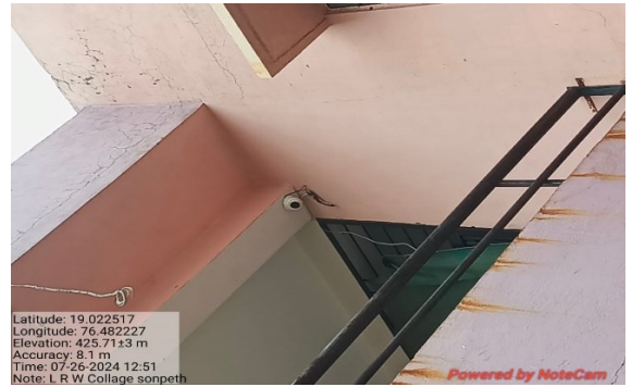
CCTV surveillance at common places