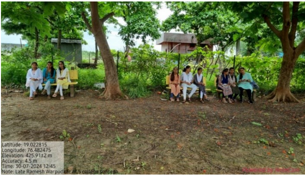
Separate Space for the leisure time