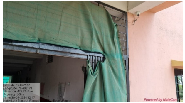
CCTV surveillance at common places