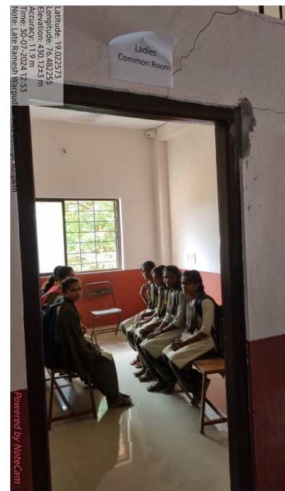
Girls Common room

classroom to meet this need the college offers common rooms strategically located in the campus.