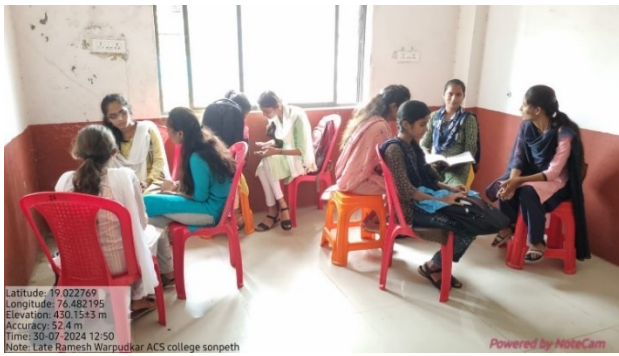
Girls Rest room