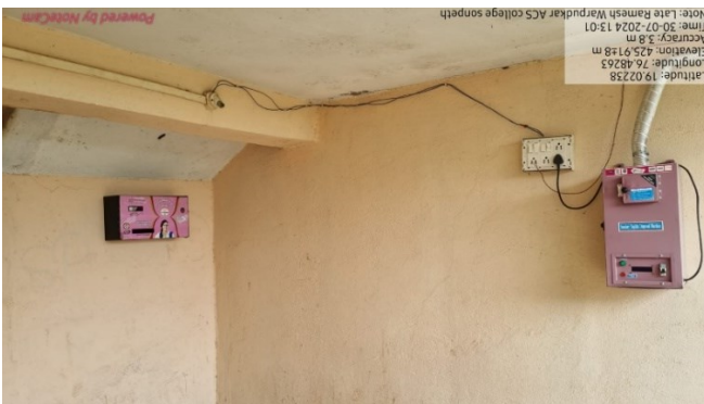
Sanitary pad vending & disposal machine for girls