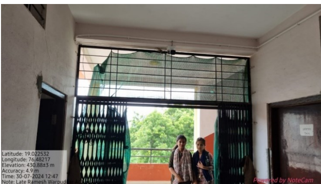
CCTV surveillance at common places