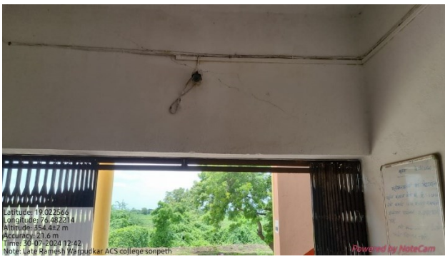
CCTV surveillance at common places