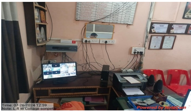
CCTV surveillance at common places