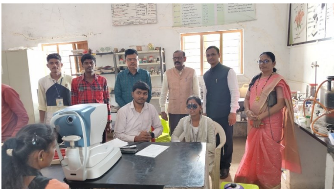
Helth Checkup Camp for Girls